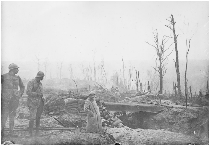
French soldiers at Verdun