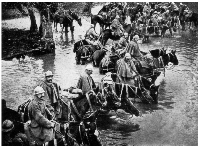
“They shall not pass” – Verdun river crossing.